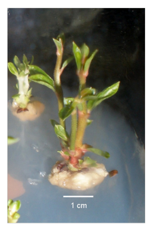
Fig.1: Callus appeared at the base of the micro-shoots of C. carandas cultured on the MS medium containing 2.0 mg/L BA

The addition of BA in the medium inhibited the root formation in C. carandas and callus, and they appeared at the base of