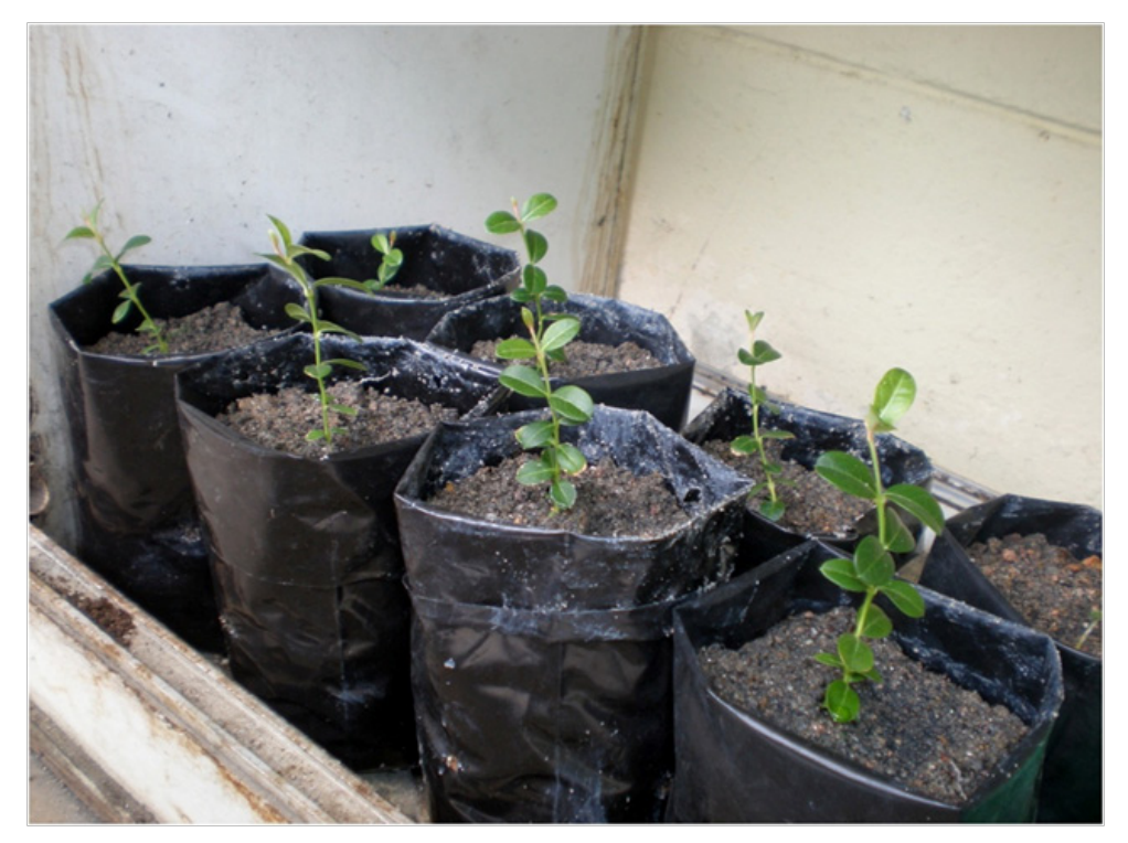
Fig.4: Four-week old acclimatized plantlets of C. carandas

The in vitro plantlets of C. carandas could survive well (84 \pm 4.3\%) when they were acclimatized in the plastic tray covered with transparent plastic sheet. However, only 59 \pm 3.7\% of the plantlets survived after four weeks of being transferred to the poly-bags and placed in the plant house. These results indicate that plantlets cannot adapt well with the outside environment. Low humidity and full exposure to light may be the main cause for the lower survival rate of C. carandas plantlets under green house condition. Nonetheless, the plantlets that survived did not show any morphological abnormalities (Fig.4).